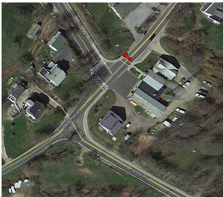
SKETCH (SUBSTITUTE STATION B)

DESCRIPTION OF SUBSTITUTE STATION B OR STATION IDENTIFIED DIRECT.