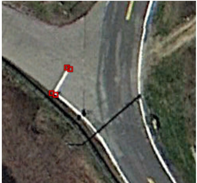
SKETCH (SUBSTITUTE STATION A)