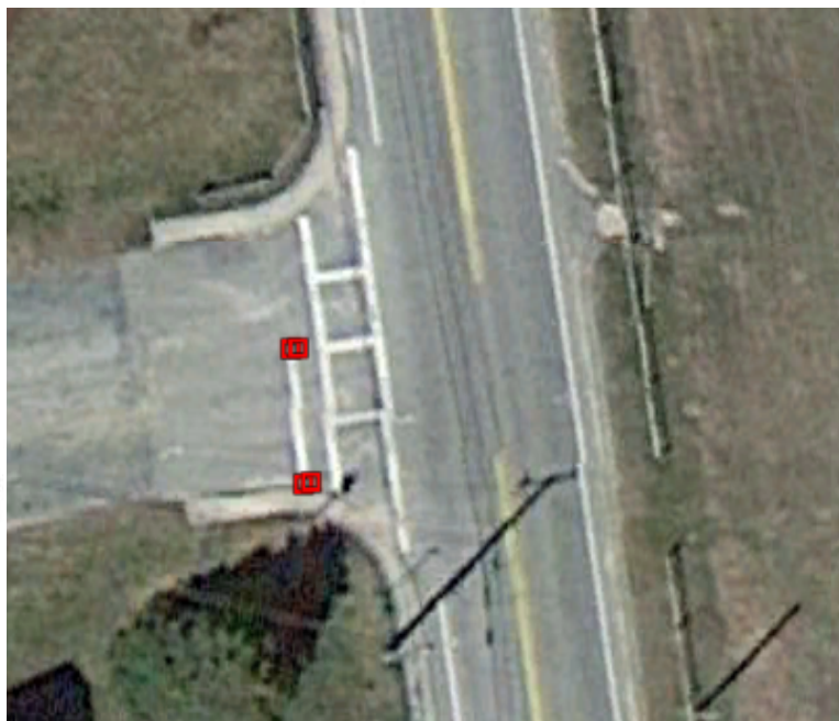
SKETCH (SUBSTITUTE STATION A)