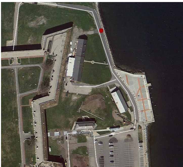
SKETCH (SUBSTITUTE STATION B)

DESCRIPTION OF SUBSTITUTE STATION B OR STATION IDENTIFIED DIRECT.