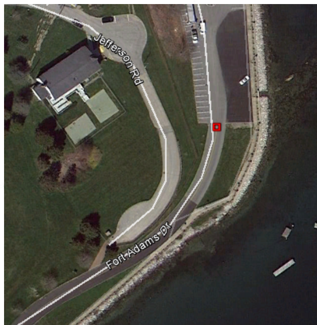
SKETCH (SUBSTITUTE STATION B)

DESCRIPTION OF SUBSTITUTE STATION B OR STATION IDENTIFIED DIRECT.