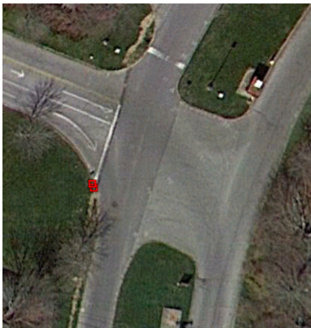
SKETCH (SUBSTITUTE STATION A)