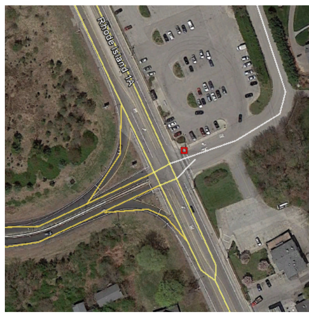
SKETCH (SUBSTITUTE STATION B)

DESCRIPTION OF SUBSTITUTE STATION B OR STATION IDENTIFIED DIRECT.