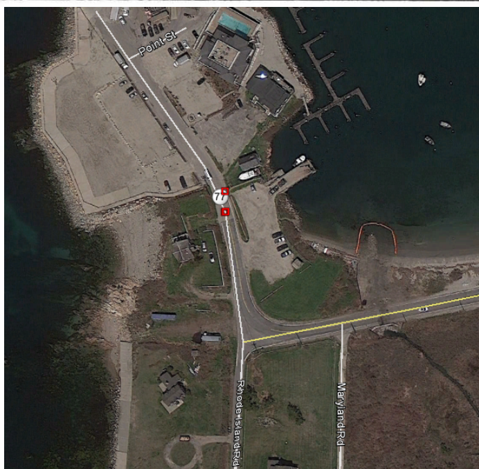
SKETCH (SUBSTITUTE STATION B)

DESCRIPTION OF SUBSTITUTE STATION B OR STATION IDENTIFIED DIRECT.